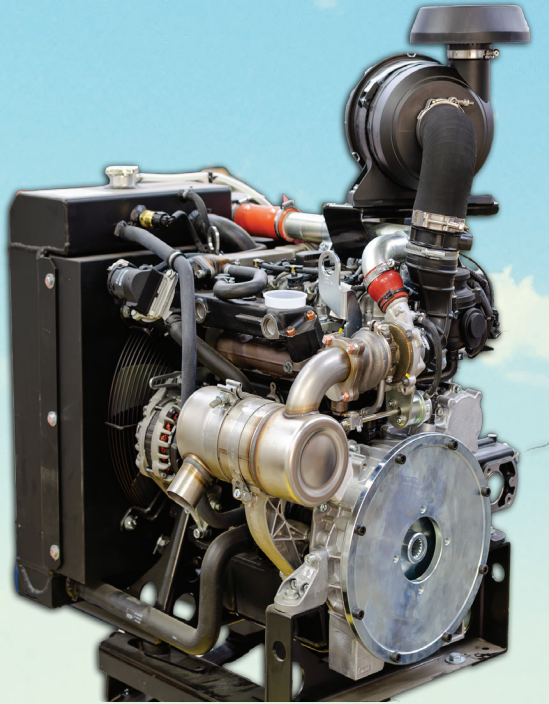
POWERFUL 56 HP HATZ DIESEL ENGINE