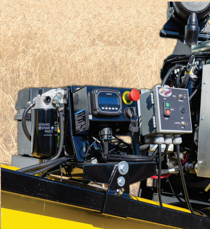
CENTRALIZED ENGINE AND CONVEYOR CONTROLS