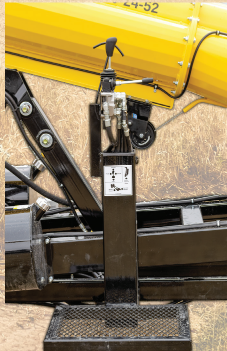
CONVENIENT RIDE-ALONG PLATFORM